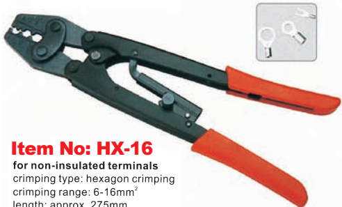
Item No: HX-16 for non-insulated terminals crimping type: hexagon crimping crimping range: 6-16mm 2 length: approx. 275mm weight: approx. 0.47kg package: blister card