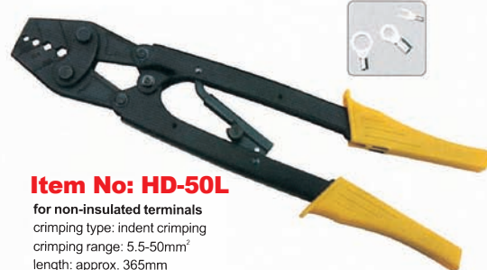
Item No: HD-50L for non-insulated terminals crimping type: indent crimping crimping range: 5.5-50mm 2 length: approx. 365mm weight: approx. 0.76kg package: blister card