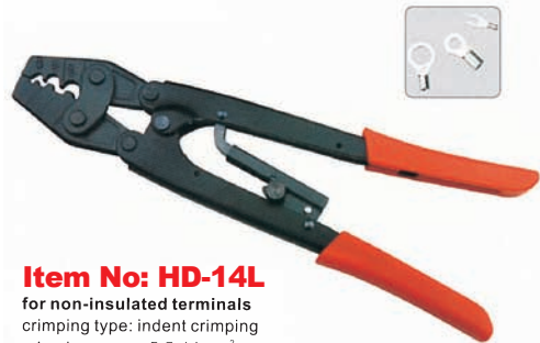
Item No: HD-14L for non-insulated terminals crimping type: indent crimping crimping range: 5.5-14mm 2 length: approx. 280mm weight: approx. 0.47kg package: blister card