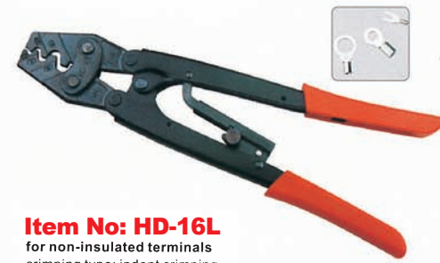
Item No: HD-16L for non-insulated terminals crimping type: indent crimping crimping range: 1.25-16mm 2 length: approx. 280mm weight: approx. 0.47kg package: blister card