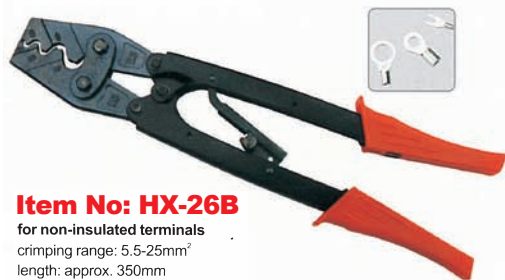
Item No: HX-26B for non-insulated terminals crimping range: 5.5-25mm 2 length: approx. 350mm weight: approx. 0.69kg package: blister card