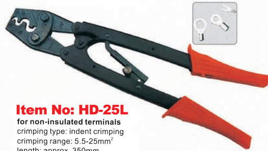
Item No: HD-25L for non-insulated terminals crimping type: indent crimping crimping range: 5.5-25mm 2 length: approx. 350mm weight: approx. 0.69kg package: blister card