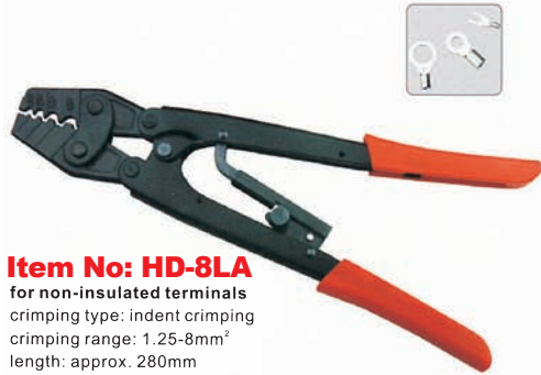
Item No: HD-8LA for non-insulated terminals crimping type: indent crimping crimping range: 1.25-8mm 2 length: approx. 280mm weight: approx. 0.47kg package: blister card