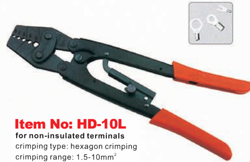
Item No: HD-10L for non-insulated terminals crimping type: hexagon crimping crimping range: 1.5-10mm 2 length: approx. 280mm weight: approx. 0.47kg package: blister card