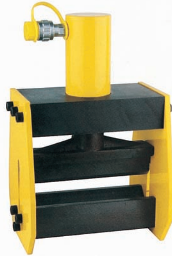
Item No: CB-200A