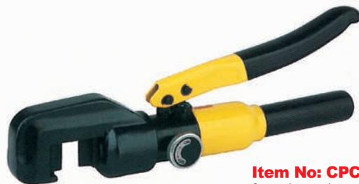
Item No: CPC-12A for cutting steel rope