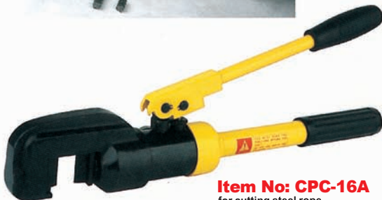
Item No: CPC-16A for cutting steel rope