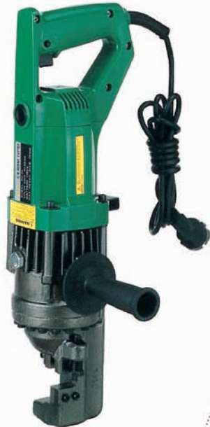
Item No: RC-16 for cutting steel rope