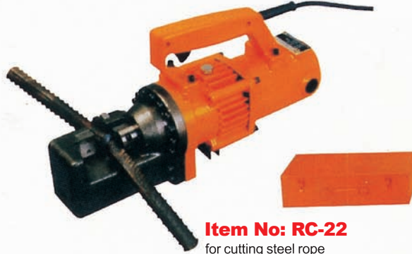
Item No: RC-22 for cutting steel rope