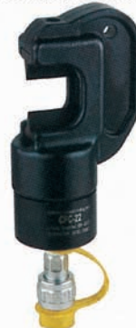
Item No: CPC-12 Item No: CPC-16 Item No: CPC-22 for steel cutting