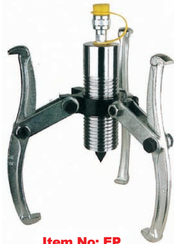
Item No: EP Integral-unit style